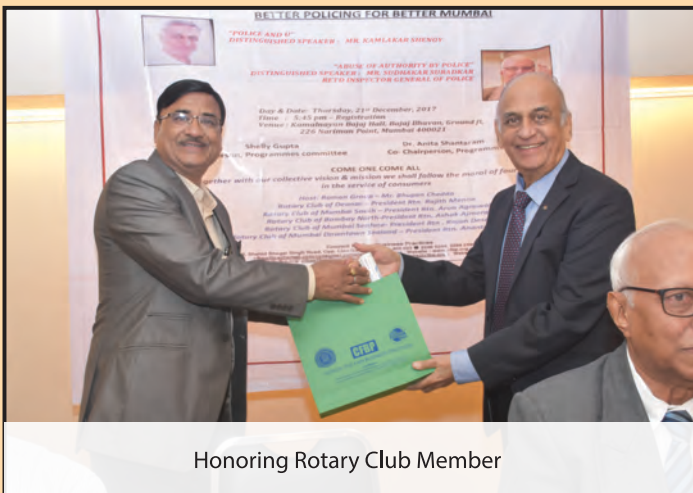
Honoring Rotary Club Member

My personal request to you all is to look into the matter where we can be of a great help to the society, now for us in Mumbai and India. We are more under economic terrorism, threat, of economic terrorism rather than cross border terrorism. Now what is economic terrorism these public servants, these well connected people are looting the public property and there we have to raise the voice and here is the point where the police comes into picture and here is the point where we have to create. Economic terrorism has to be stopped and to stop economic terrorism we have to be very strong with 217 and 218 and I request you again we will stop economic terrorism. We will make Mumbai the best part to stay in, provided you all are with me and you all use 217 and 218 against public servants, Thank you so much