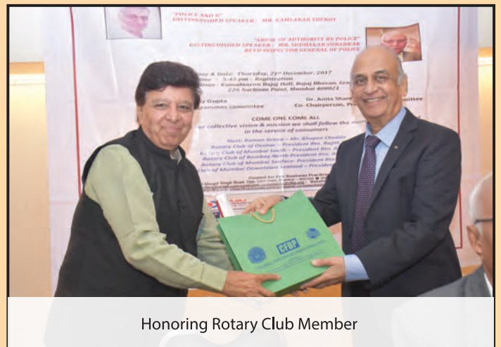
Honoring Rotary Club Member