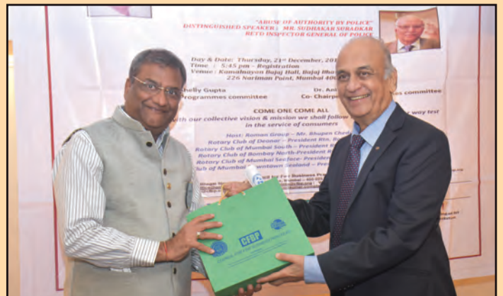
Honoring Rotary Club Member