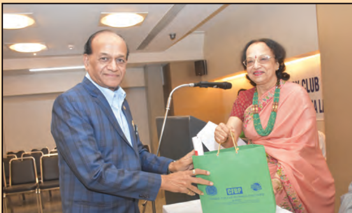
Honoring Rotary Club Member

So friends, actually I don't like to have a monolog, I would prefer to interact. There are very wrong notions about policemen one of them they are overworked. I don't agree here, work is work. If you like work its pleasure. Now if you see many times policemen are posted what is known as Picket, now what are these Pickets doing?, They don't interact with the common man, citizen, they