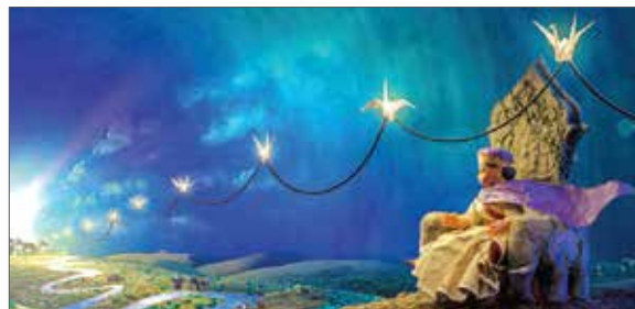
By innovating solutions, we ensure electrification without causing harm to wildlife.

Ever since we began our journey, it was one dream that kept us going. A dream to bring the nation's dreams to life. And we did. We touched a billion lives with over 1,400 products. We put up over 7 lakh street lights and over 1,700 km of transmission lines. We lit up more than 25,000 villages, and illuminated hundreds of stadia and monuments across the nation. And to experience this glorious journey visit: www.magicoflight.bajajelectricals.com