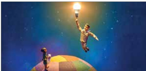
By electrifying villages, we help generate employment opportunities for the locals.