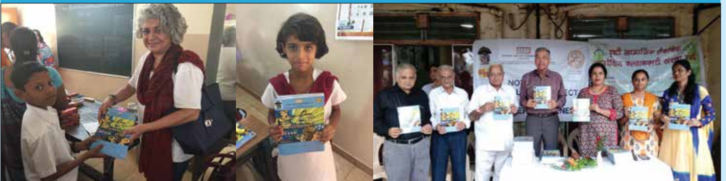
Shree Sarvajanic Balmandir School, Mumbai