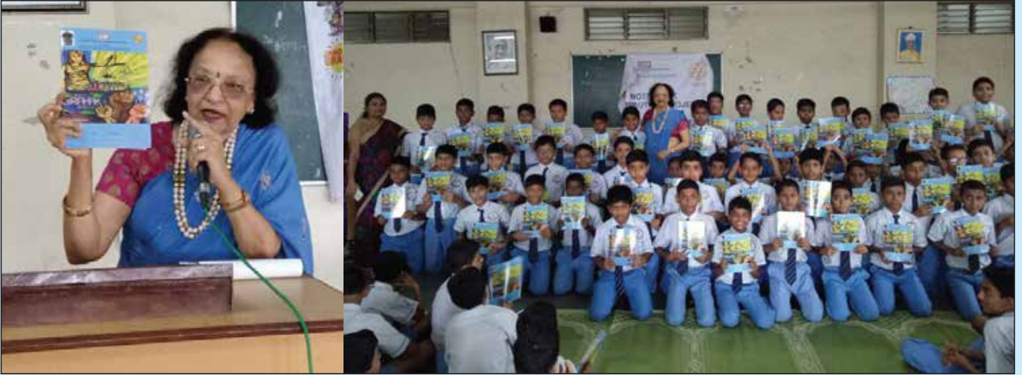
Sahyadri Parisar Shikshan Mandal, Ratnagiri