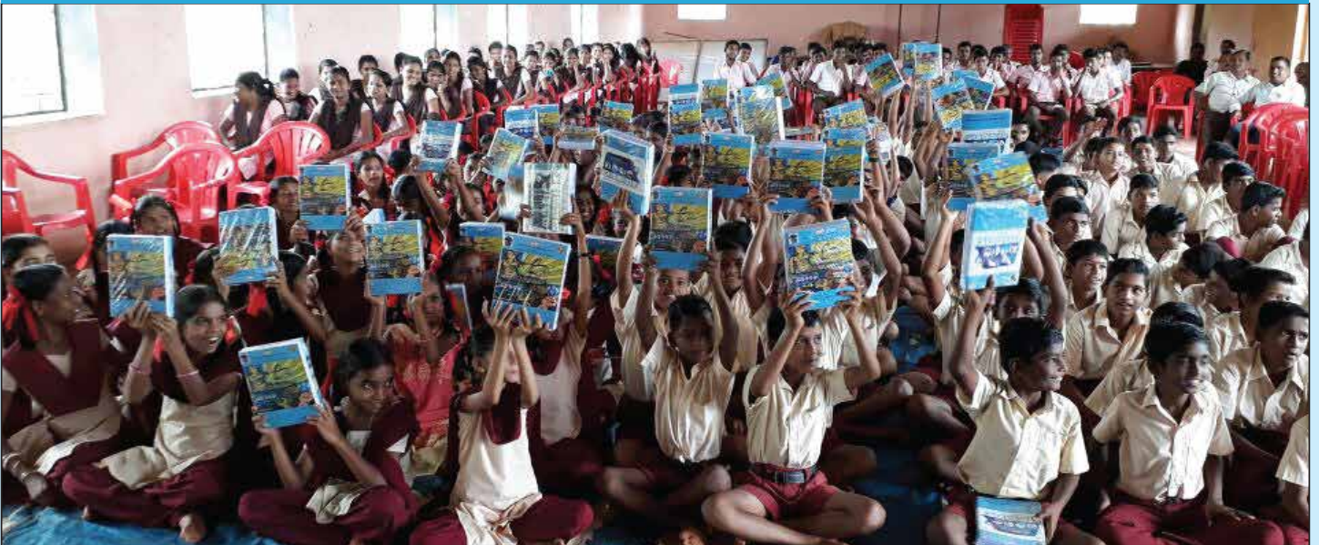
Vikas Prathamik Vidyalaya, Pune