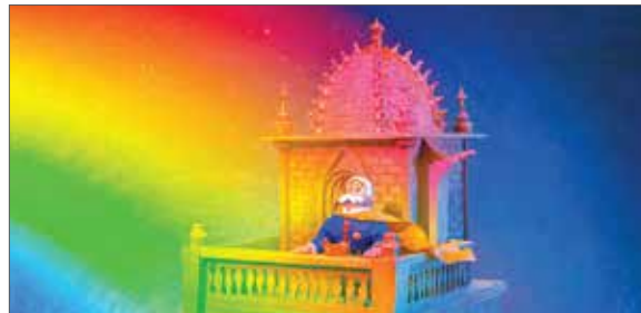
By lighting up monuments and sports arenas to showcase India's glory.