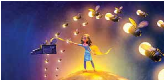
By lighting up street lights across India, we empower women to pursue their dreams.